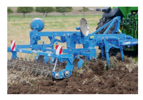
The skim plough (picture: a Ovlac skim plough) allows precise superficial tillage due to the support wheel.

Alternatively to the skim plough a cultivator may be used (picture: a Lemken Terradisc). The duck feet undercut the soil and any docks across the entire working width. The working depth can be adjusted with a support wheel. The cultivator mixes the soil more intensively than the skim plough.