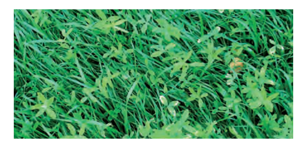
In arable land, after dock control, there may be time for a late summer cover crop such as rye-grass and Persian clover. The deep root growth helps transporting nutrients up from sub-soil, mobilising phosphorus, and building up soil structure.