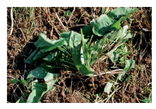
A dock plant after the passage with the cultivator: The plant was cut off at a depth of at least 12 cm to avoid that it resprouts.

Such intensive 'fallow' treatment must be followed by a competitive crop to avoid re-establishment of docks.