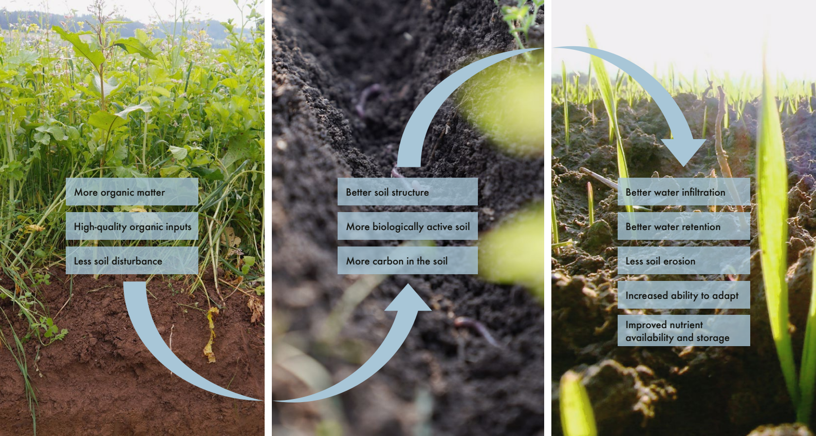
Soil life depends on sufficient organic matter and low soil disturbance to perform their tasks. Organic farming practices support underground ecosystems, and farmers reap the benefits in a variety of ways.