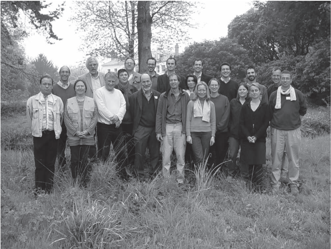
Participants of the workshop held April 29 – 30, 2004