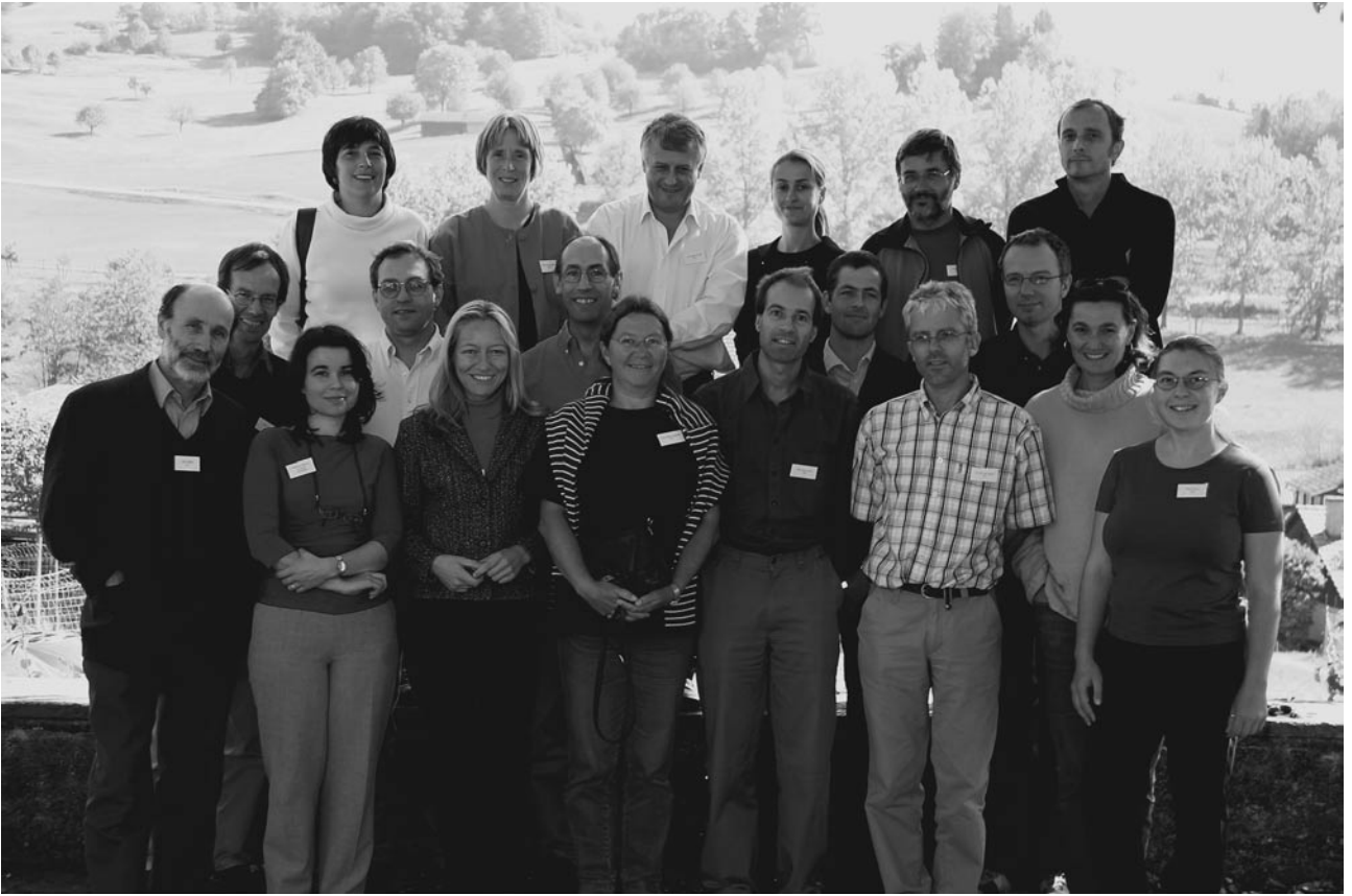
Participants of the workshop held September 25–26, 2003