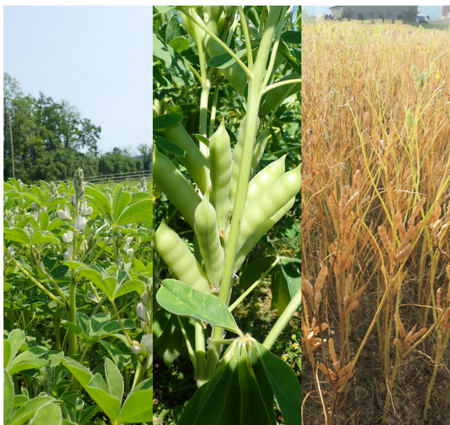
Figure 3. In flower, pods filling, and ripe white lupin