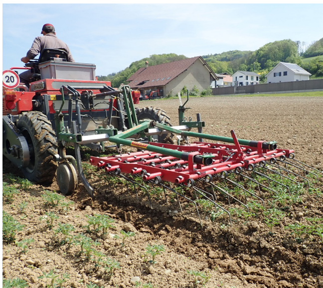
Figure 2. Weed control is particularly important for the prevention of late weeds. The crop can be weeded mechanically in the early stages.