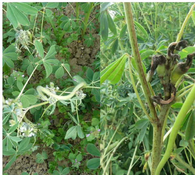
Figure 4. The dreaded anthracnose disease leads to localised twisted growth of whole plants at flowering time (left) and to black, twisted pods at maturity (right). The worst disease patches can be removed from the field by hand at flowering time.