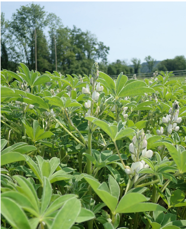
Figure 1. The white lupin

White lupin ( Lupinus albus ) is a different botanical species to narrow-leaved or „blue“ lupin ( Lupinus angustifolius ). It tolerates heavier soil and has a higher yield potential, but does not ripen until August/September. Important cultivation practices include the use of healthy, certified seed, sowing as early as possible and using the right cultivar to reduce the impact of the fungal disease anthracnose, which is spread through the seed. The most important experiences from organic farming are summarized here.