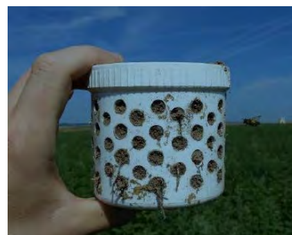
Figure 1: Schematic representation of a pot and plate trap as well as an image of a Meles pot trap.