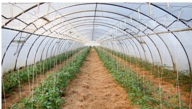
Fig. 1 Regional organic tomato cultivation in unheated plastic tunnels in Austria

practices (Lindenthal et al. 2010; Meisterling et al. 2009). Some research has been conducted to systematically compare the environmental burdens resulting from the entire tomato supply chain to the retailer in a manner that integrates agricultural production, including its upstream requirements, with those of the transport chains (Roy et al. 2008; Sim et al. 2007; Blanke and Burdick 2005; Andersson et al. 1998).