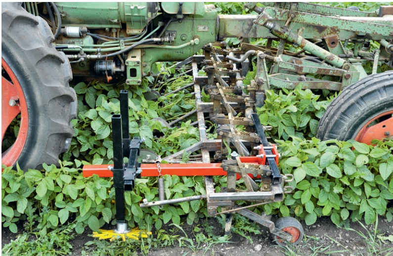
Ideally, when weeding before crop canopy closure, weeding should also be carried out in the row.