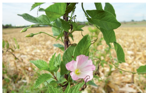
Bindweed, from the Convolvulaceae family, contains tropane alkaloids, but in much lower concentrations.

In addition to the listed plant species from the Solanaceae family there are other tropane alkaloid containing plant families such as the crucifers and convolvulaceae. These species generally have no relevance agronomically but if they occur in marginal strips of cultivated land, they should nevertheless be prevented from spreading further afield.