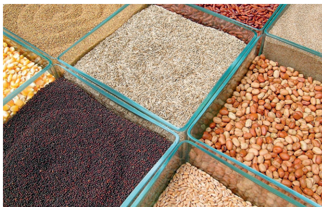
At risk seeds are examined at crop acceptance for contamination with tropane alkaloids.

If tropane alkaloids limits are exceeded – whether statutory or those of the processor – the batch will not be accepted.