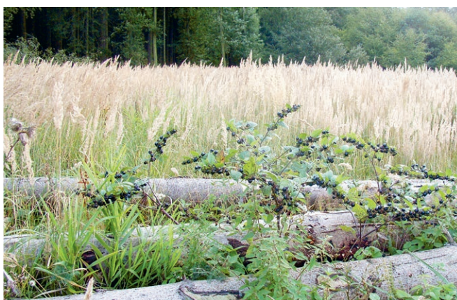
Also field margins need to be regularly checked for plants containing tropane alkaloids.