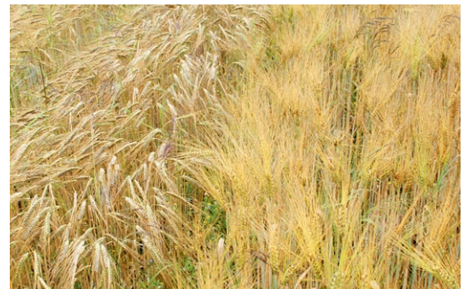
Winter cereals suppress late germinating problem weeds better than spring crops.

Combatting weeds by tillage in summer, as is recommended against thistles or dock, promises little success against plants containing tropane alkaloids. The method combats newly germinated plants, but cannot completely eliminate the weeds because of the large seed bank in the ground and its viability.