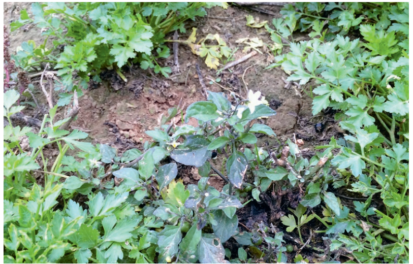
Atropa Belladonna can establish itself on productive agricultural land. Here a young belladonna plant in a parsley field. To prevent seeding into the crop, the belladonna plants should already be removed from the field margins and from areas adjacent to the crop.

Basically, Henbane, Datura and Belladonna can occur in any culture; for instance in winter cereals after frost damage or in cultures with feeding damage, in which bare areas occur in the crop, where weeds can develop in late spring.