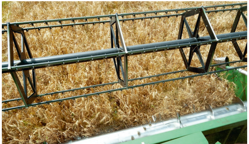
Removing plants containing tropane alkaloids before harvesting is often not economically feasible. Therefore, weed control is of great importance before canopy closure.

When cleaning the crop with a cylinder or gravity table, contamination may not necessarily be excluded. Optical seed cleaning methods effect a more thorough cleaning. It is therefore worthwhile to seek effective solutions for an optimal separation of the weed seeds in cooperation with processors and other suppliers.