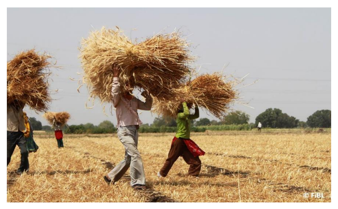
Associated and rotational crops contribute to farm profitability in the tropics. The picture shows the harvest of a wheat crop, a rotational crop in cotton production in India.

A recent paper from the Research Institute of Organic Agriculture FiBL demonstrates that organic production systems in the tropics are as profitable as conventional systems. The paper emphasises that organic farming does not solely rely on main cash crops for export to generate income. Associated and rotational crops play a crucial role in enhancing farm profitability. The paper is based on data from 12 years of long-term organic trials in Bolivia, India, and Kenya, and offers new insights into the art and science of organic farming in the tropics.