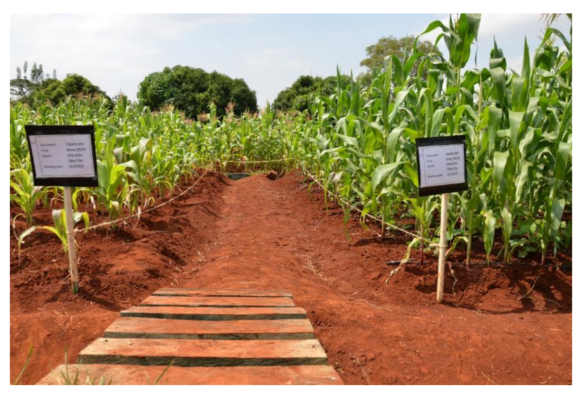
In Kenya, the cropping systems involves maize as the main crop, and legumes, vegtables and potatoes as associated crops, which are highly important for the income and nutrition of the local population.