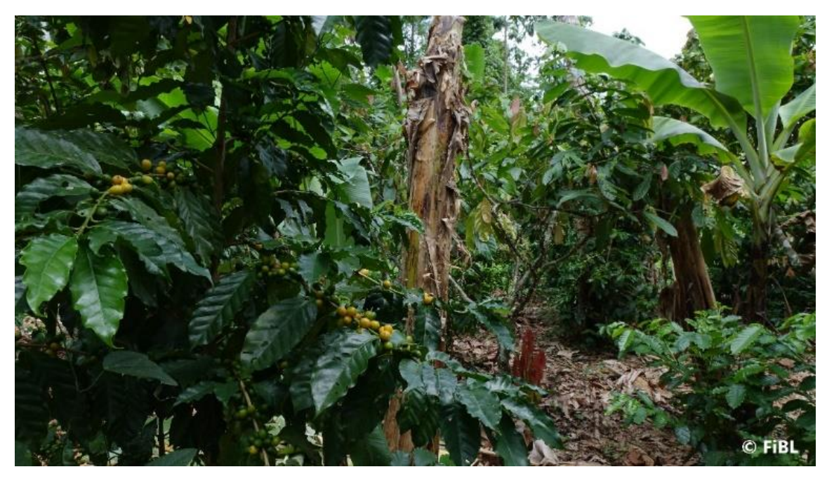
Organic production systems (like the cacao agroforestry system in Bolivia pictured above) are just as profitable as conventional systems through the interplay of cash crops with associated crops (e.g. bananas, curcuma, ginger, maize, peach palm and other fruit trees).