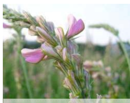
Fooder crops like Chicory and Sainfoin (Esparsette)